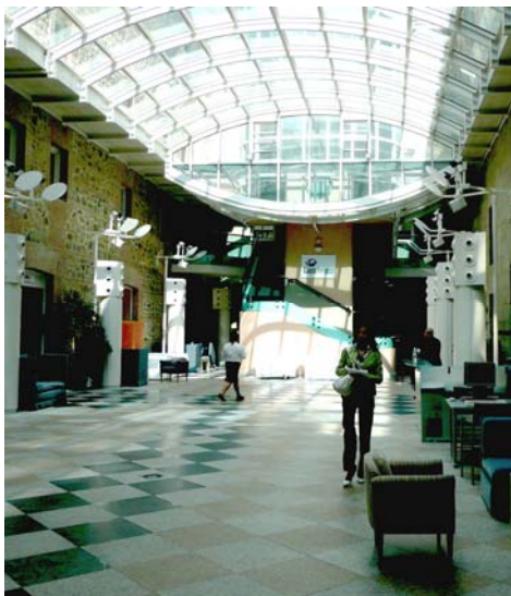
Seminar Hotel Euroforum

On 7 and 8 October the INGEDE Seminar “Reciclaje de papel—una necesidad para la situación actual” took place at San Lorenzo de El Escorial, near Madrid.