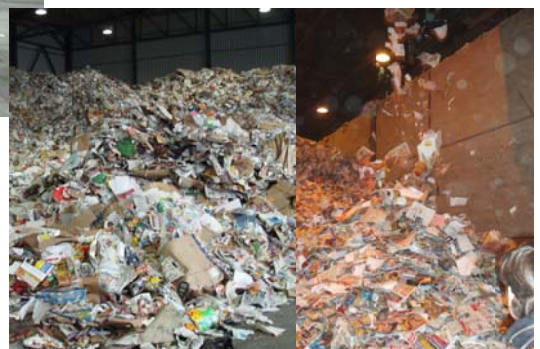
Recovered Paper before and after screening