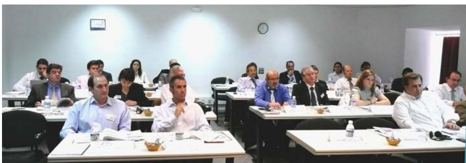
seminar audience on 8 Oct 2009